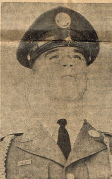
High School in 1958 where he played football.