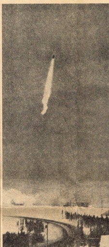
NIKE-HERCULES BLASTS OFF for a designated target east of Fairbanks in one of the most spectacular events to culminate the Army's year 1959.